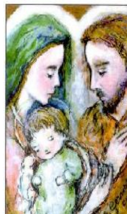
Pray for Unborn Human Life

Week 10 “My brain is very big compared to the rest of my body right now. That’s all part of God’s design. My body is so big that you could cradle me in a soup spoon and my legs would hang off the end! Can you believe how far I’ve come in just 10 weeks? - From microscopic to over 5cm in such a short time! Pretty soon my mommy will need to start wearing some clothes that give me a little more growing room. Please pray for me.”